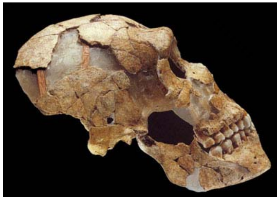
Fig. 1: Skull of a "more recent" representative of the Neanderthals, the Saint-Césaire (Dépt. Charante-maritime, France).